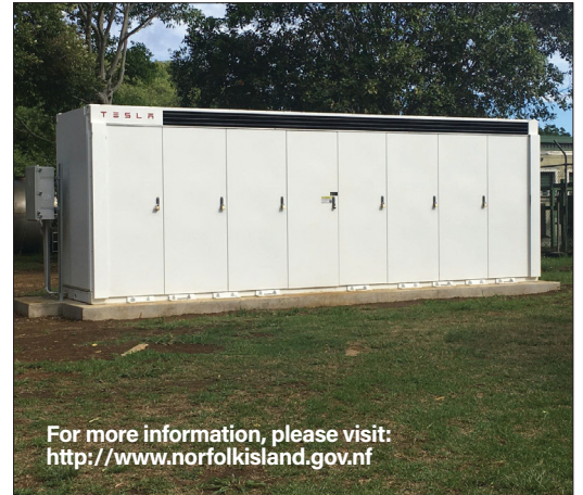
For more information, please visit: http://www.norfolkisland.gov.nf