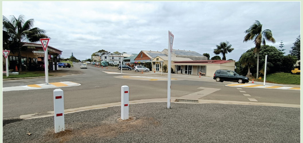
Roundabout works on the corner of Taylors Road and Grassy Road.