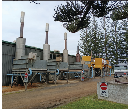
Transitioning from fossil fuel to renewable energy.

footing. Part of this submission provides a financial assessment in order to build a pathway for the introduction of multiple tariffs, particularly feed in tariffs, and a pathway to reduce current fee, set at $0.72 per kilowatt by at least half by 2024.