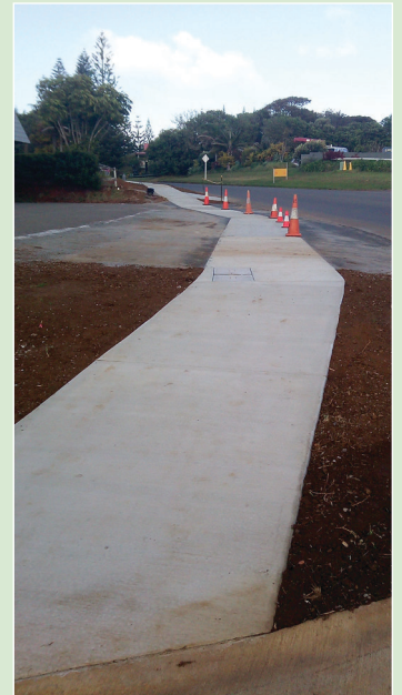
Airport to Burnt Pine footpath works.

For more information, please visit: http://www.norfolkisland.gov.nf