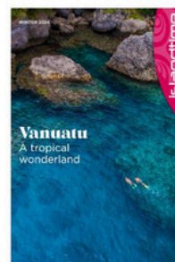
CLICK TO READ - WINTER 2024