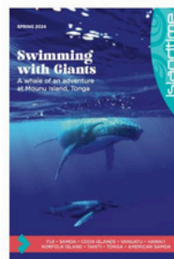
CLICK TO READ - SPRING 2025

Islandtime Magazine is the only trade publication in New Zealand and Australia that's dedicated to Pacific travel. In each issue, we feature a variety of island destinations, provide updates and news from all around the region and talk to the people that are shaping travel in this wonderful part of the world.