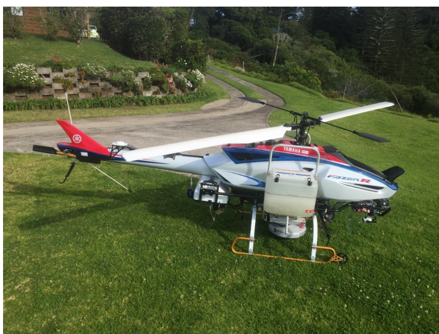
Figure 2 . Yamaha Fazer Drone

The aerial baiting is an important step towards the eradication of Argentine Ants on Norfolk Island. Please note that no aerial video footage or photography will be taken as part of any drone work carried out as part of the Argentine Ant Eradication Program.