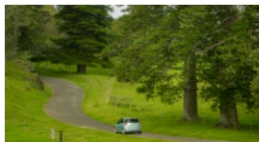
Get inspired, read our BLOGS