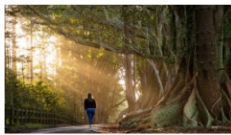
MORE TIME IN NATURE