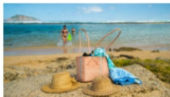
MORE TIME TO RELAX