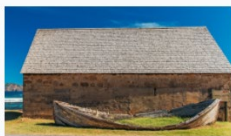
MORE TIME TO HEAR STORIES