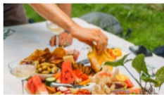
MORE TIME TO TASTE