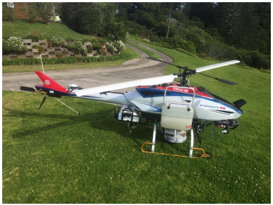
Figure 2 . Yamaha Fazer Drone

Greg Quinn, the Yamaha Fazer drone pilot has arrived on Norfolk Island and has started to aerially map the flight path with a smaller drone to establish flight paths prior to commencing aerial treatments from the 25th October. The Yamaha Fazer drone (see picture below) will distribute ant bait in dense vegetation and difficult to access terrain and will significantly increase the area that can be baited effectively. The methods have also been refined and trialed to ensure no misting will occur and numerous protocols have been identified that can eliminate the risk of bee death, including moving bee hives well away from the treatment area, and conducting treatments in conditions of appropriate wind strength and direction that limit potential exposure The aerial baiting is an important step towards the eradication of Argentine Ants on Norfolk Island. Please note that no aerial video footage or photography will be taken as part of any drone work carried out as part of the Argentine Ant Eradication Program.