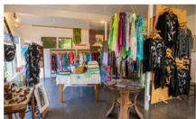
Plastic Free Island

One of the many local businesses supporting the island's waste free journey is Aatuti Art .