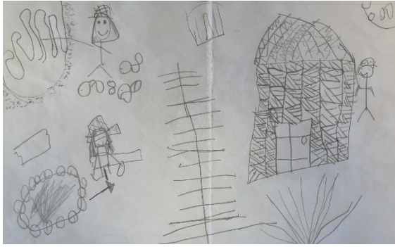
Winner competition entry by Immi

A big thank you to all the participants, the entries were of such high quality it was hard to select winners. Staff are already planning next holiday's activities so remember to keep an eye out for our new activity sheets in September. If you can't wait until the next school holidays, drop in during our opening times as all children and locals have free entry to the museum.