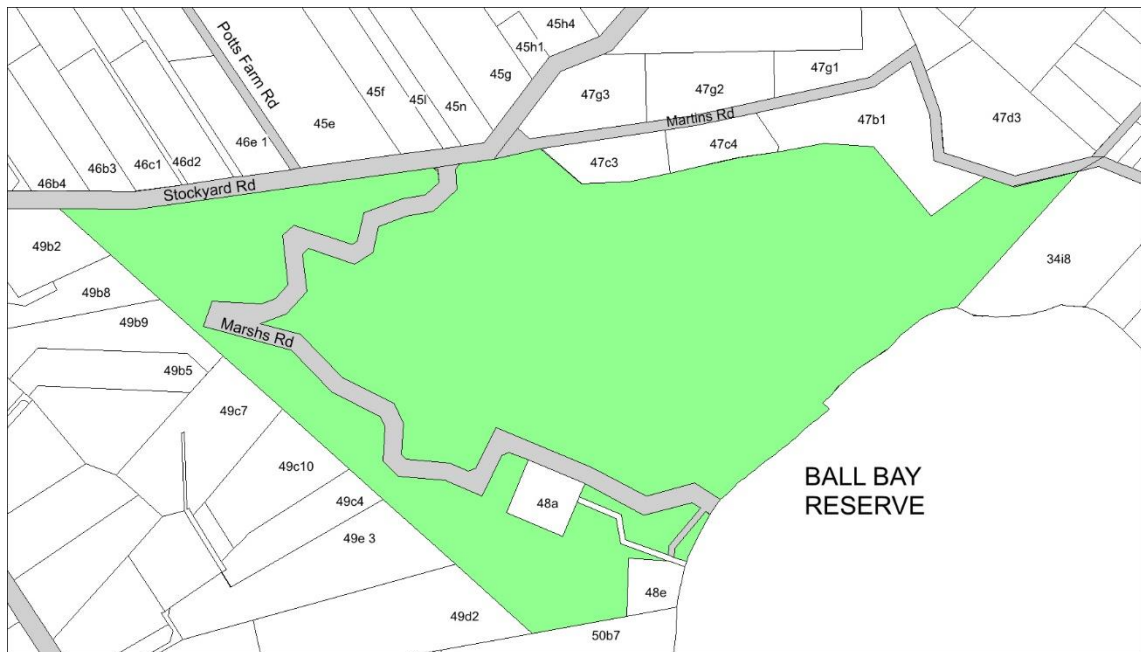
Figure 2: Ball Bay Reserve Boundaries