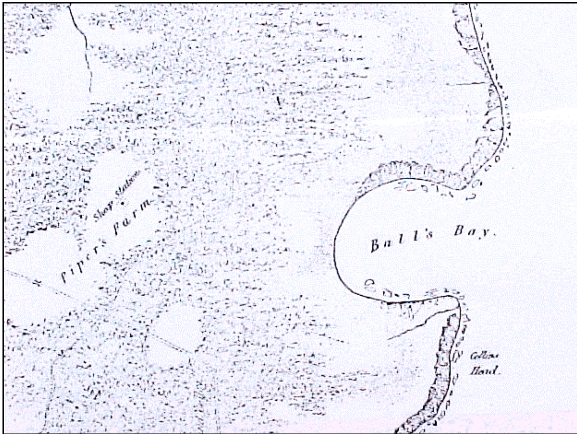
Figure 4: 1840 Arrowsmith Map Showing the Ball Bay Reserve Area

Ball Bay has played an important role in the economic and cultural development of Norfolk Island. A local whaling industry was established in Ball Bay in the latter half of the 19th century and whaling ships from America and Europe often visited Norfolk Island. Whalers intermittently called for supplies at both Pitcairn and Norfolk Islands, maintaining the link between the two communities and providing opportunities for trade and employment. The South Seas Whaling and Sharking Company Ltd operated the last whaling station in Ball Bay in 1950.