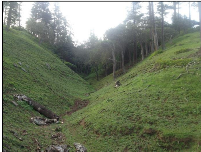
Figure 5. 2017 photo of cleared, grazed steep slopes. Despite recent rain and grass cover, exposed tree roots are visible, and terracettes can still be seen along the slopes

Cattle grazing has had and is having a significant impact on the ecology of Ball Bay Reserve. This is partly due to the fact that large parts of the Reserve have been cleared of native vegetation, and partly due to the steep terrain. Large, hard hooved animals walking along steep slopes cleared of vegetation has contributed to the degraded landscape shown in Figure 5.