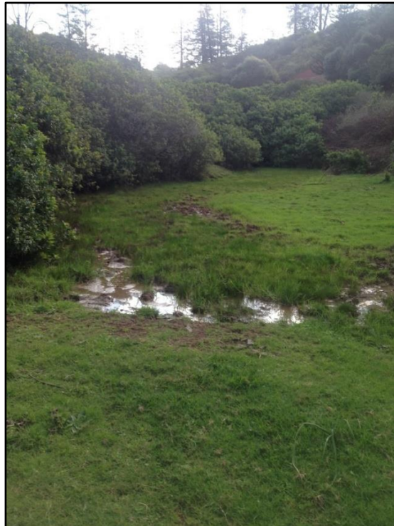
Figure 6. Wetland on hairpin bend in Marshs Road showing damage due to stock grazing

Another significant issue with grazing in Ball Bay Reserve is reliable access to drinking water for stock. The creeks in Ball Bay Reserve are, for the most part, ephemeral. The one creek that rarely dries out is located in the west of the reserve, flowing down to the picnic table near the foreshore. Figure 6 shows the damage that cattle are causing to the wetland area near the hairpin bend in Marshs Road. Wetlands are scarce on Norfolk, and stock access to wetlands damages water quality and the native flora and fauna that utilise these areas. The Norfolk Island Natural Resource Plan of management 2009 recommended as a priority across the island that 'All wetlands and important water sources are to be protected and fenced off from cattle and/or control measures implemented to prevent animal waste entering the water.'