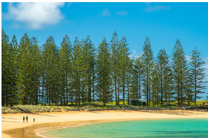
Norfolk Island injected with a surge of marketing activities .