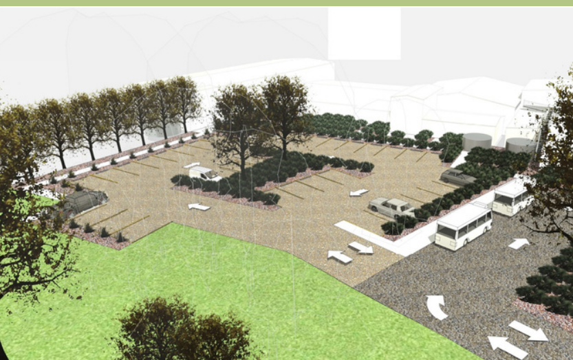
Norfolk Island proposed carpark plan.

We want to thank the community for their feedback on the plans for the new car park we had on exhibition.