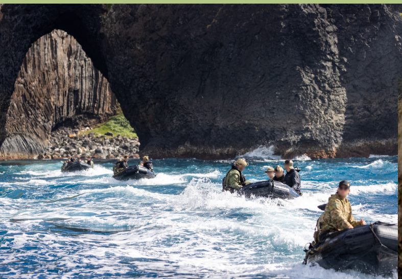
Thousands of troops engaged across the land, sea and air in Exercise Talisman Sabre 2023. A different clientele than usual graced our airport departure lounge.