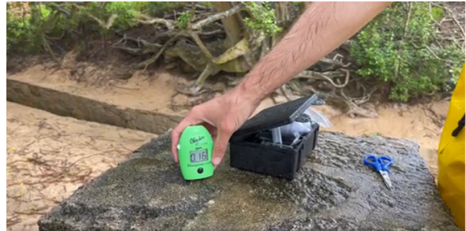
Soaked waste water hot topic on island.

We all want to ensure that our environment and water supply are as safe and healthy as possible, so please contact the Environment Team before you purchase or install a system or submit a Development Application. They have a passion for the environment and are here to help you achieve the best result. For more information email: douglas.donaldson@nirc.gov.nf or Arthur.travalloni@nirc.gov.nf