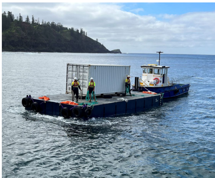
Norfolk Island freight carries waste off land

The community would also be aware that there is a variety of heavy and oversized items to be brought to the island, including processing and logistics equipment for waste management and a drill rig and explosives to develop the quarry at Cascade. For this reason, NIRC has organised another heavy-lift shipping vessel to visit Norfolk Island in early October this year. The vessel, operated by BBC Chartering, will bring a shredder, excavator, bobcat, drill rig, and a variety of containers with equipment and materials for NIRC projects.