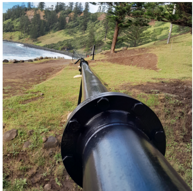
Water works upgrades underway on island.

Following the July Ordinary Council meeting, it was resolved to continue the design process with Premise consultants. Detailed design of the plant is expected to be finished in the middle of 2024, while NIRC will continue to work with the designers and the Commonwealth Government to secure funding for the project in the future.