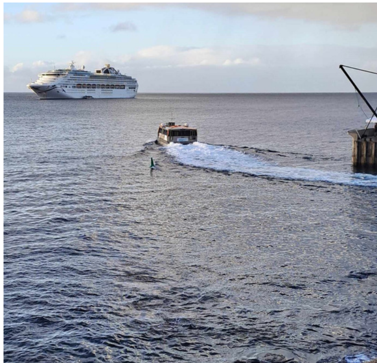
Water works upgrades underway on island.

What a day for the island and what a day for our visitors showcasing Norfolk at its best.