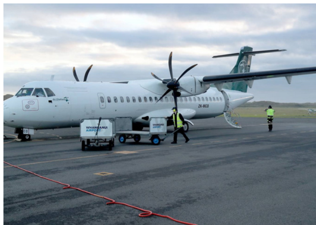
Air Chatham frequently flies into Norfolk Island.

What does this mean? More spacious seating, greater on-board service, and the seating capacity goes from 34 to 68 seats.